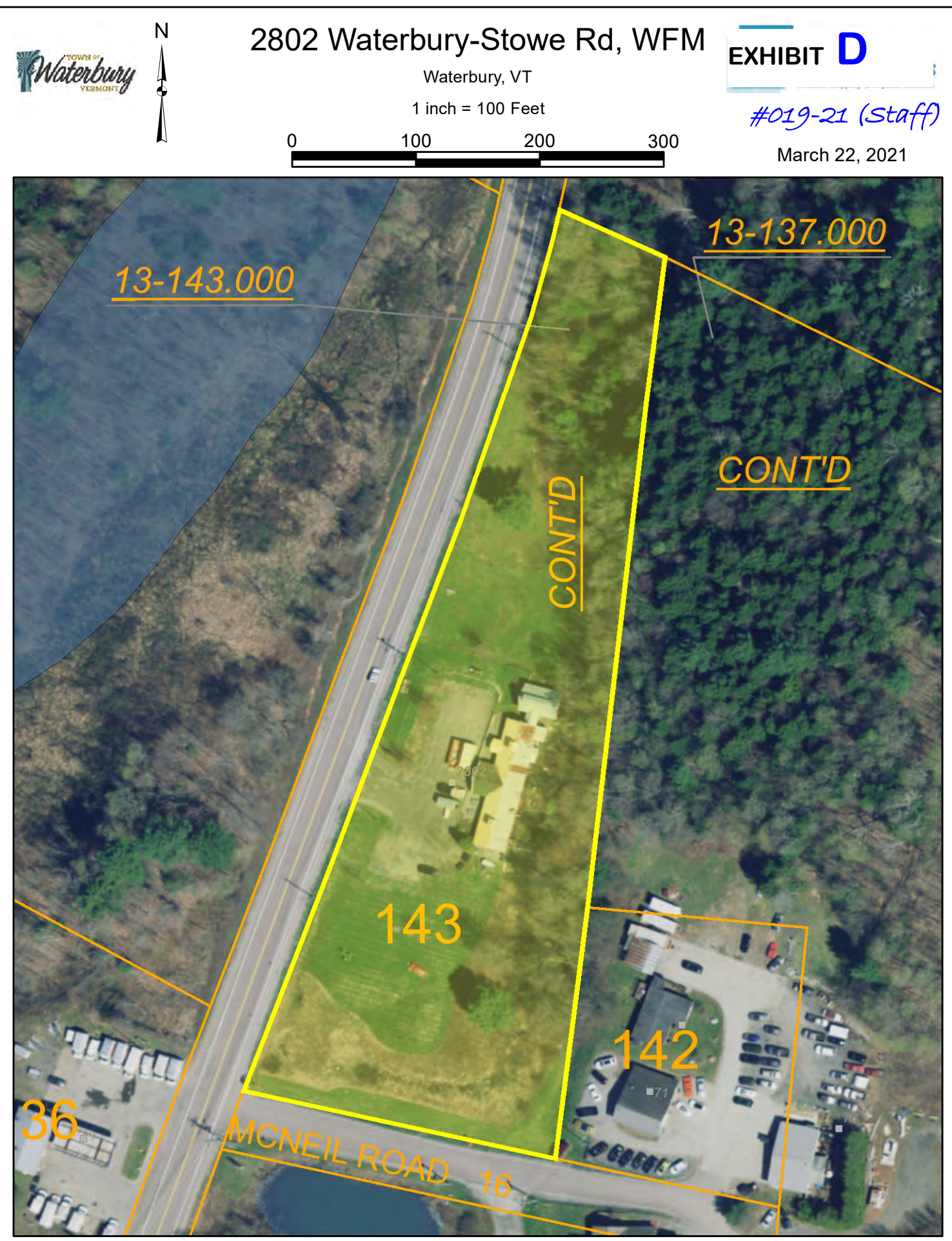
Data shown on this map is provided for planning and informational purposes only. The municipality and CAI Technologies are not responsible for any use for other purposes or misuse or misrepresentation of this map.