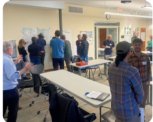
Trails Summit photos courtesy of Erika Linsky.