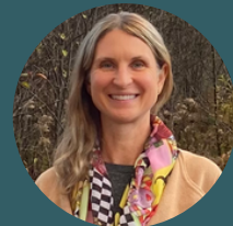
Meet our new Recreation Director

THE TOWN OF WATERBURY'S MONTHLY NEWSLETTER