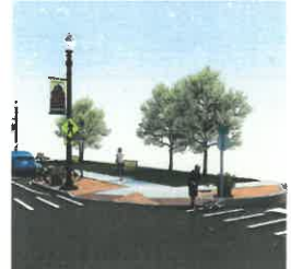
Improved Pedestrian Crossings