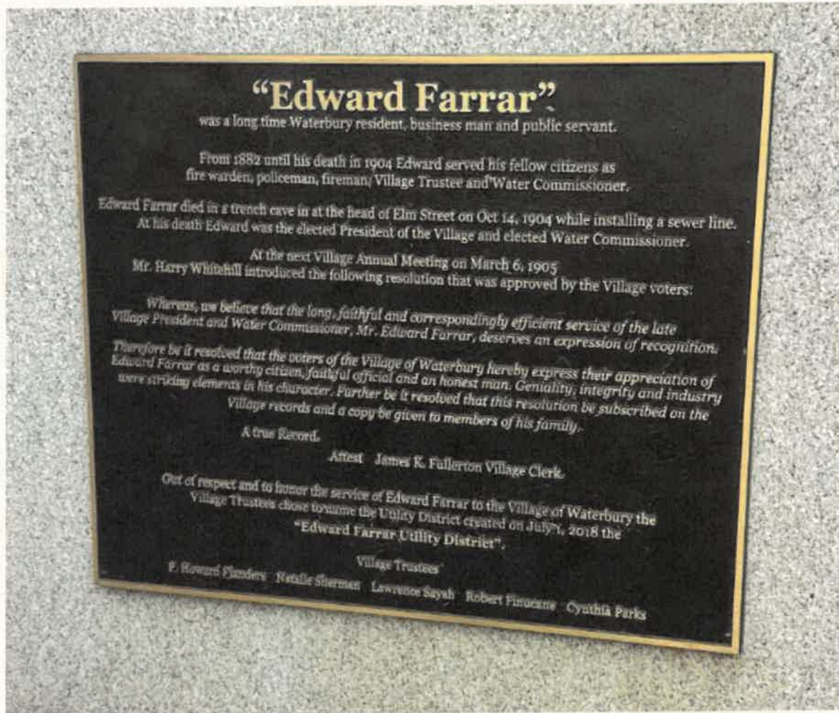
The commemorative plaque on Farrar's gravestone in Hope Cemetery.

The ceremony on Oct. 14 took place 119 years and one day after Farrar met his tragic end.