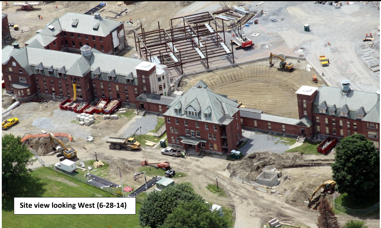
Site view looking West (6-28-14)