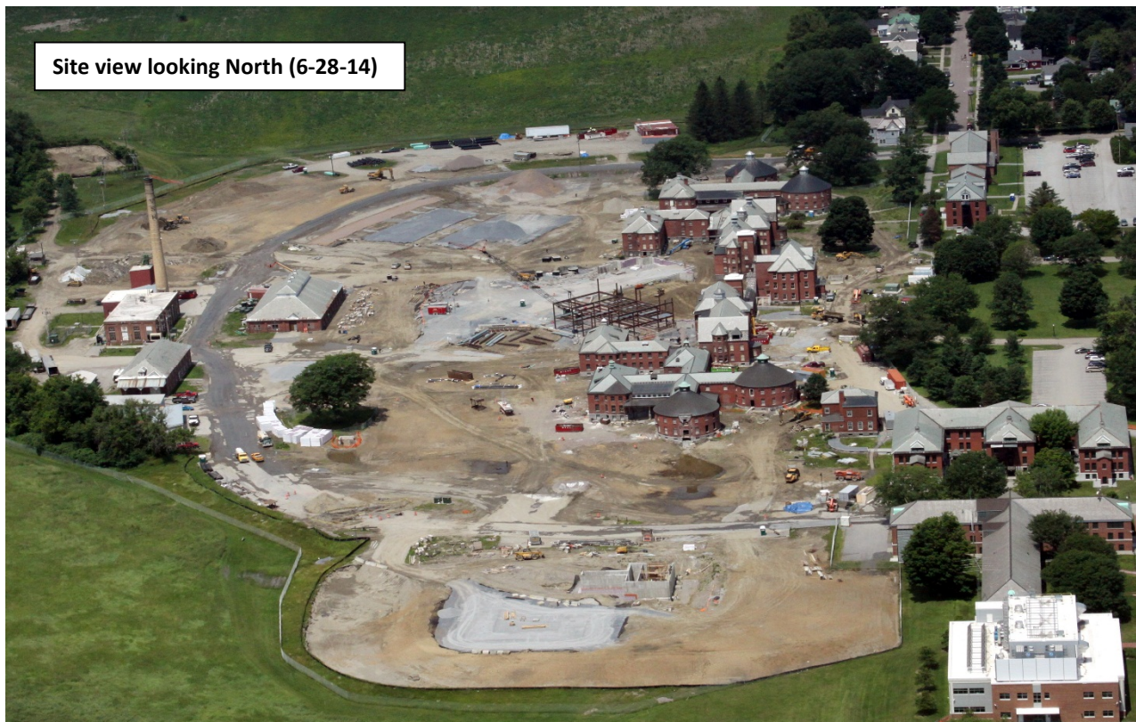
Site view looking North (6-28-14)