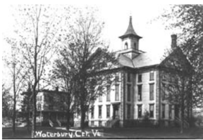
GREEN MOUNTAIN SEMINARY

Seminary, with an entering class of "106 gentlemen and 104 young ladies." The two lower floors were used as classrooms with the third and fourth for "gentlemen's rooming." Note the entrances on intersecting wings and on the gable ends of the main structure. A belfry tower and walkway were removed in 1941; the exterior of the building is largely in original condition and was restored and converted to housing in 2001.